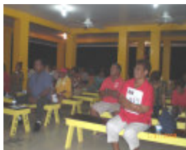
Outreach - Airai 1/31/2008

Alsekum e kemilai a teblong el udoud ruche i ra August 2, 2007, e chelechang eng di chimong, e moutekang el mei ra social security office e desang el kmo ngerang me uaisei.