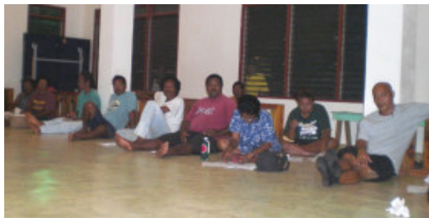
Outreach - Ngardmau 2/27/2008