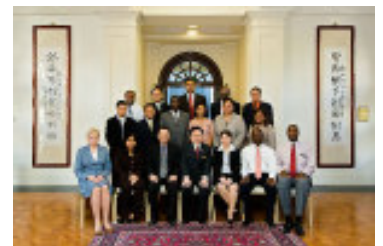
Participants Group photograph at the Social Security System in Singapore and Administration of a Provident Fund Course

What is the Central Provident Fund? The Central Provident Fund is Singapore's Retirement Program , which in some ways is similar to the Social Security Administration except it has more features. The role of the Central Provident