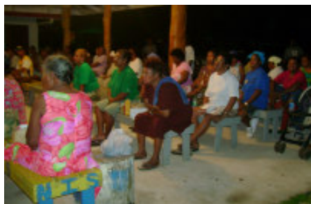
Outreach - Ngeremlengui 3/12/2008

kobechiil e diak ar ngelekem eng mora dalam ma demam, ea lak eng mora rucedam mar ruchellem, ea lak eng mor ngikel oungerachel ra estate er kau.